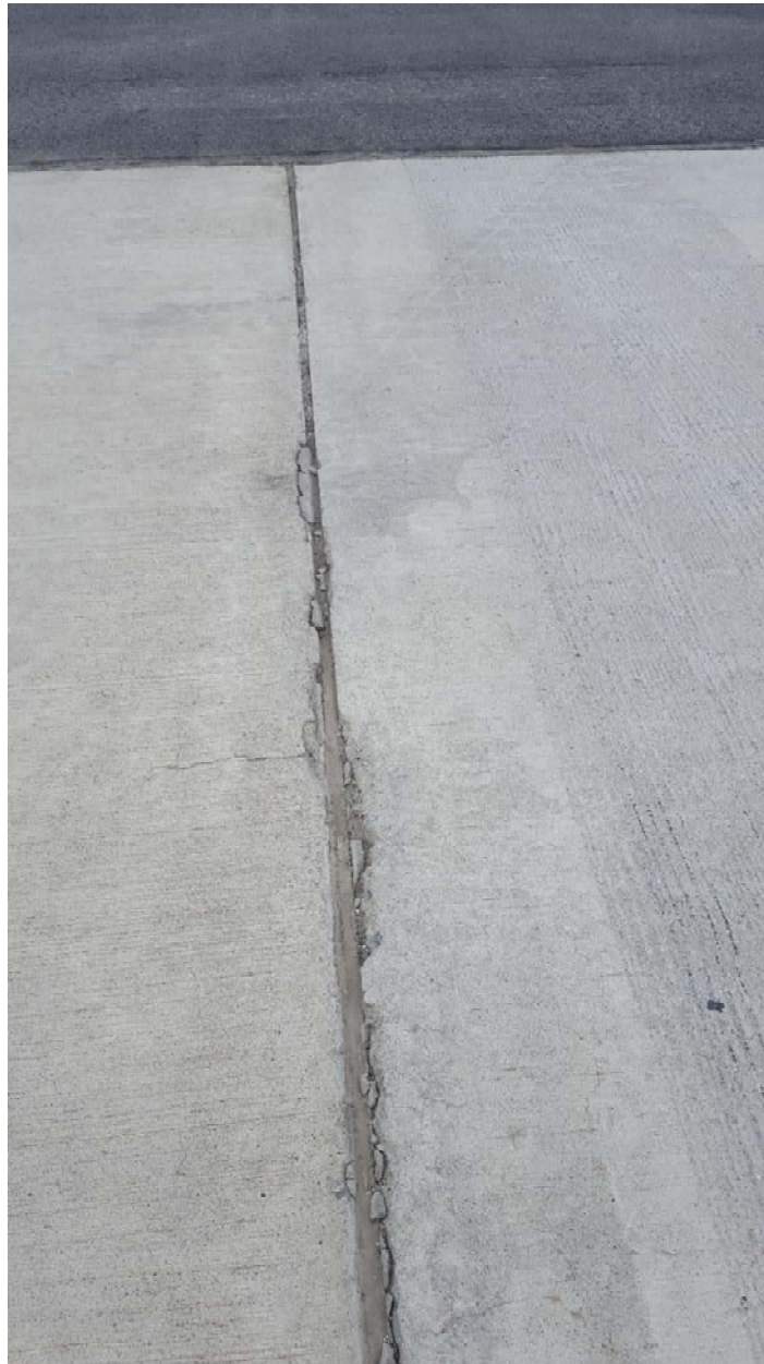
Helipad Medium Joint Spalling